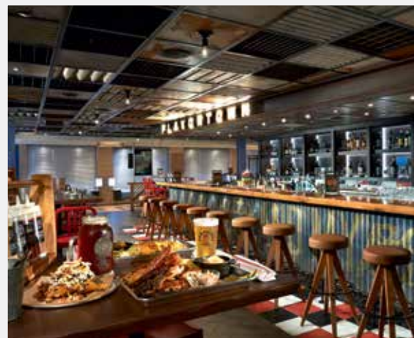
FROM TOP: Carnival Panorama arrives in Long Beach; the Pig & Anchor

A seven-day Mexican Riviera round-trip cruise from Los Angeles on Carnival Panorama starts at £519, including all meals and port fees, departing May 9. Flights are not included. carnival.co.uk