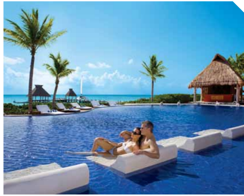
FAR LEFT: Outrigger Koh Samui Beach Resort