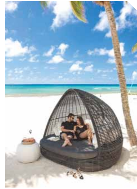
BELOW: Jade Mountain, Saint Lucia

→ fire already make the Caribbean one of the most romantic places on the planet. But it's not just nature that lures the lovebirds; there's a plethora of anniversary packages available that offer cherry-on-the-cake extras, easy-to-book add-ons and hard-to-turn-down discounts – making your job a whole lot easier.