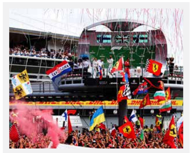
TOP: Winter testing at Circuit de Barcelona-Catalunya ABOVE: Lewis Hamilton wins last year's Italian Grand Prix

Grandstand Motor Sports offers packages to major motor sports events worldwide. A three-night package to the Italian Grand Prix on September 8 starts at £819, including flights from Gatwick to Milan, B&B accommodation in Lake Como, airport transfers and transport to Monza on Saturday and Sunday. grandstandmotor.com