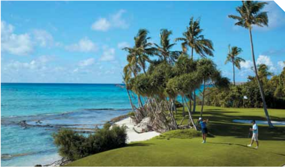
LEFT: Shangri-La Villingili Resort & Spa