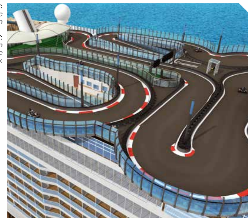
RIGHT: Norwegian Encore go-kart track

➔ Book it: From £1,810 for a seven-night cruise round-trip from Rome departing September 7.