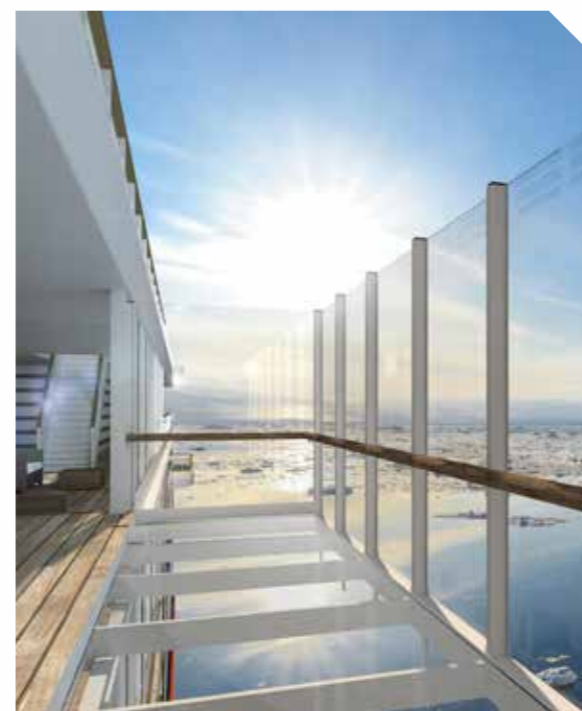
LEFT: Hanseatic Inspiration