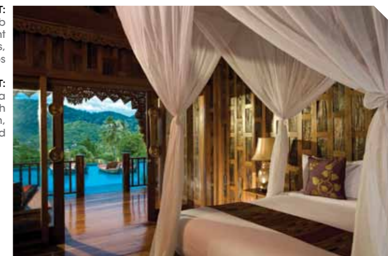
RIGHT: Santhiya Koh Phangan, Thailand

seductive views of the cerulean sea. Elsewhere there's a spa and a good selection of water sports, and it's all spread across seven hectares of tropical forest that flanks a gold-sand beach, making it a sure-fire hit for couples seeking a romantic getaway.