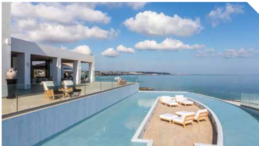
ABOVE LEFT: Parklane Resort & Spa, Cyprus

And Zante has its own new lavish treasure to boast about: the adult-only Lesante Blu Exclusive Beach Resort, which opened last year and is a member of the Leading Hotels of the World. Close to resort town Tsiviliv and a stone's throw from a Blue Flag beach, it's a haven for couples, with 'his and her' spa treatments alongside a handful of Honeymoon Suites. →