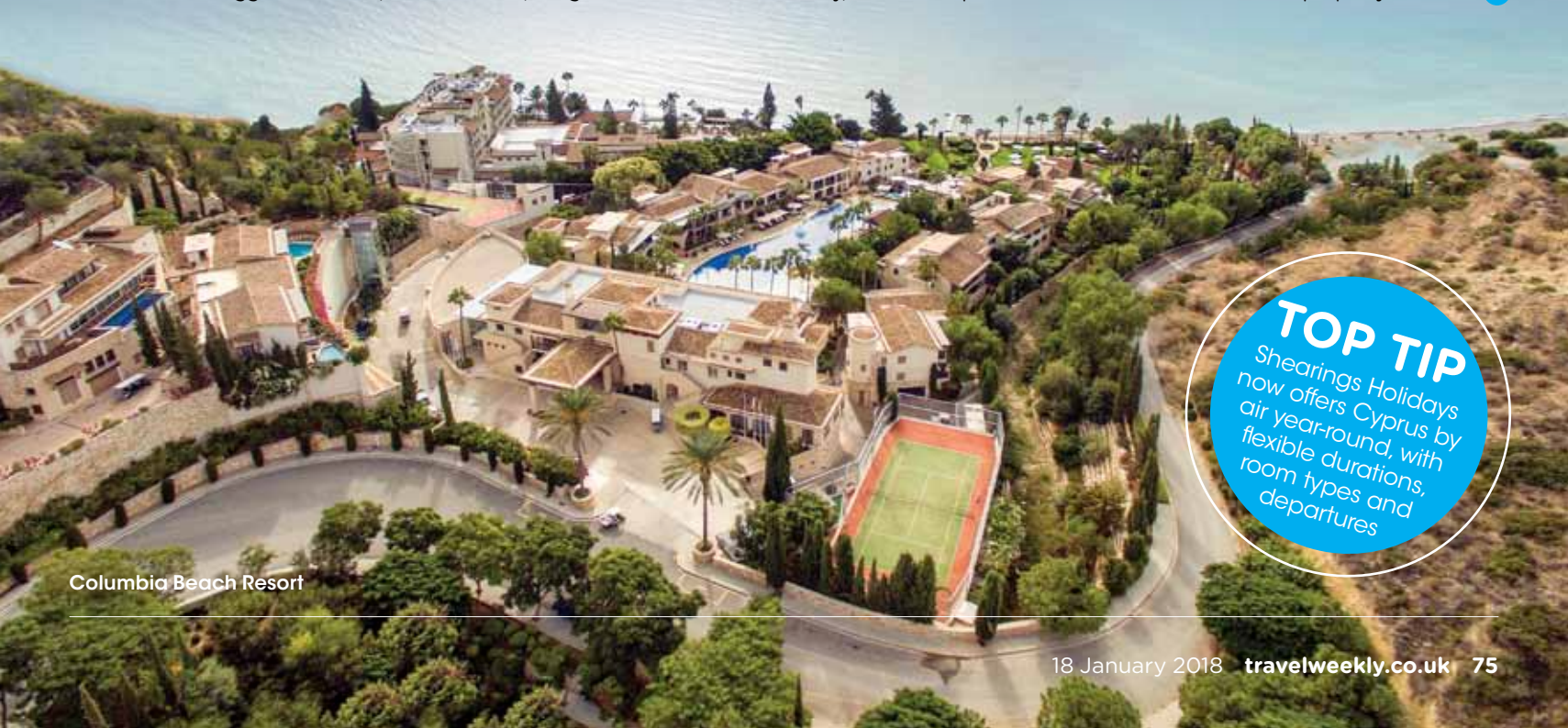
Columbia Beach Resort

Meanwhile, in Larnaca the island's first Radisson Blu – 15 minutes' drive from the airport – will be opening for the summer, to be followed by a second Radisson Blu property in 2019. →