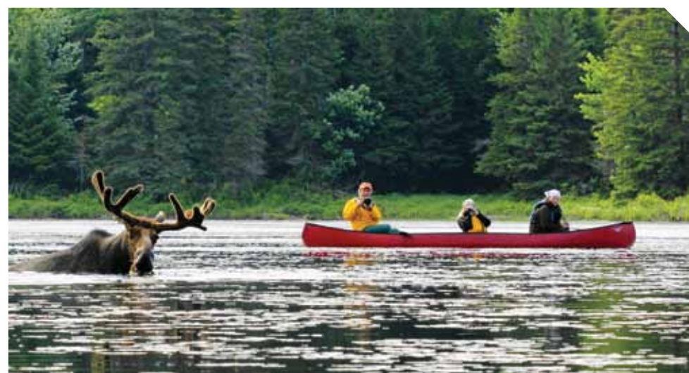
ABOVE LEFT: Mont Tremblant

*Low deposit of £79pp applies to new bookings made between 30th March and 30th April 2018 (inclusive) only. Exclusions apply, please see our website for details. This offer is subject to availability and may be withdrawn at any time.