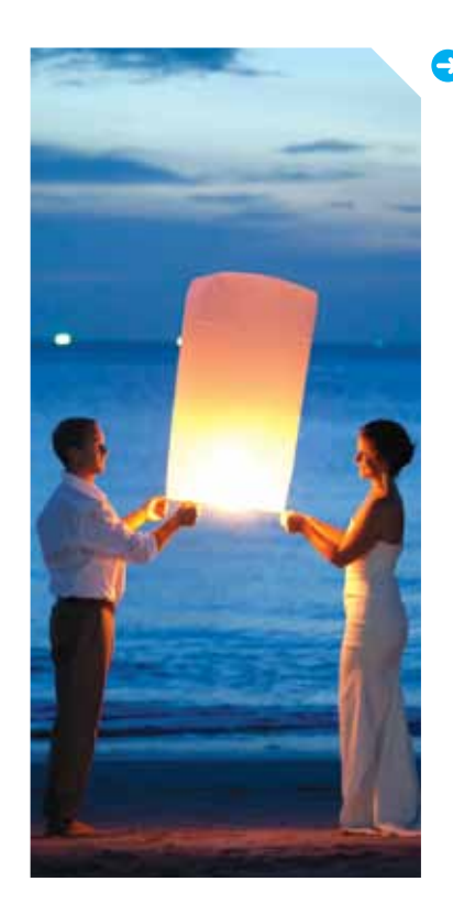
ABOVE: Layana Resort & Spa, Thailand