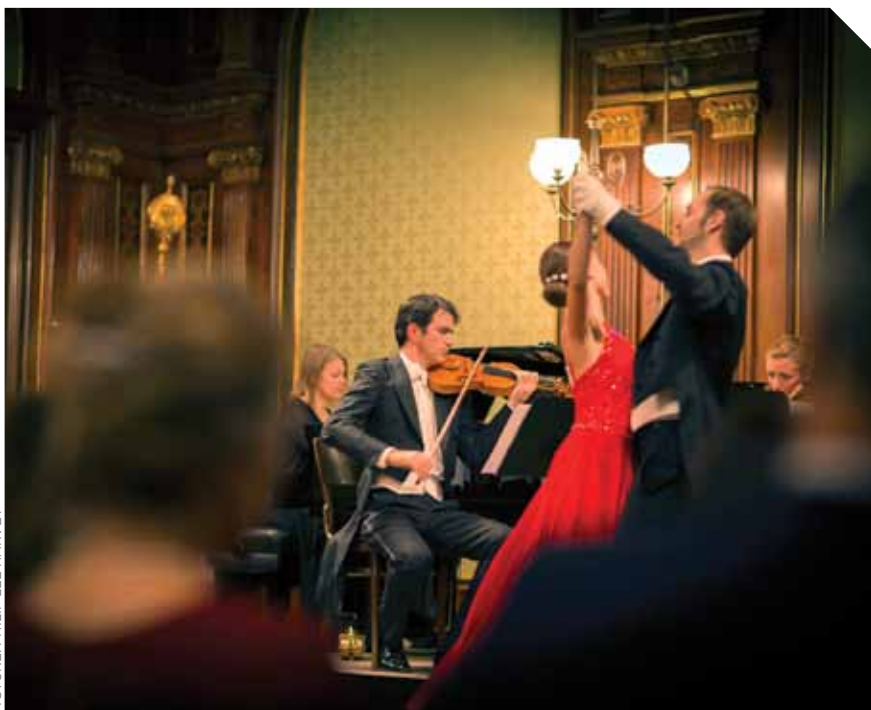
ABOVE LEFT: Amsterdam