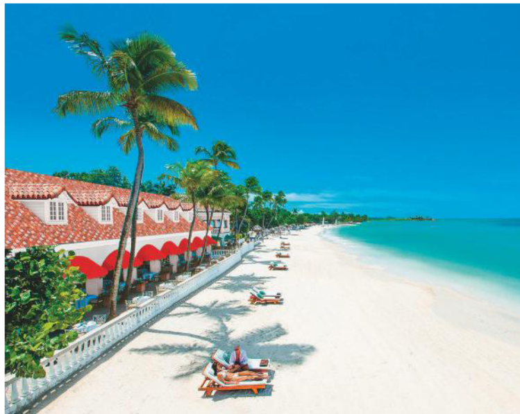
CLOCKWISE FROM TOP LEFT: Florence; Sandals Grande Antigua; Hilton Seychelles Labriz Resort & Spa