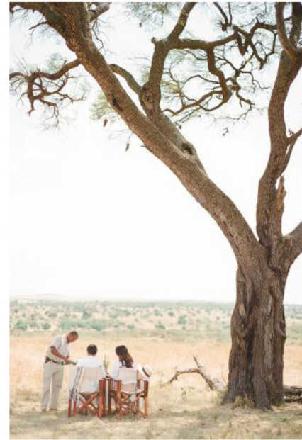
FROM LEFT: Isle of Skye, Scotland; Bush breakfast at Serengeti Bushtops, Tanzania

and nature in Sri Lanka, which offers exceptional value. By contrast, the Maldives offers picture-postcard beaches, and is the ultimate dream of luxury and tranquillity," she says.