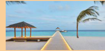
Hotel rates are based on per person per night based on two adults sharing.