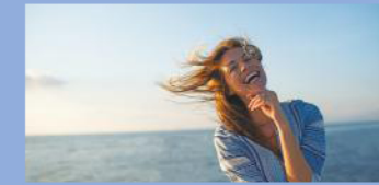
Cruise rates are per person, based on double-occupancy and include meals, entertainment, port charges and taxes.