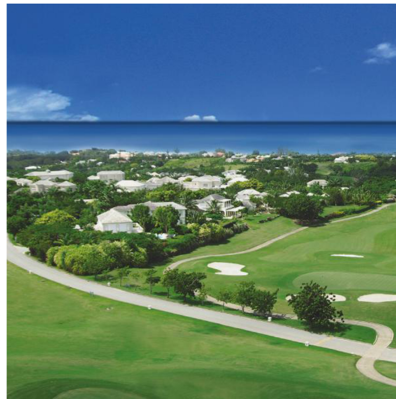
CLOCKWISE FROM BOTTOM LEFT: Havana, Cuba; diving off Grenada; Toraille waterfall, Saint Lucia; Royal Westmoreland, Barbados