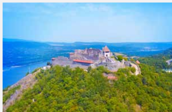
FROM TOP: Canoeing on the River Danube; Visegrád's High Castle

Active & Discovery on the Danube is offered on Avalon Impression (in 2019) and Avalon Illumination (2020). A nine-day Active & Discovery on the Danube (westbound) cruise on Avalon Impression from Budapest to Linz departing October 28, 2019, starts from £1,387 per person cruise-only. avaloncruises.co.uk