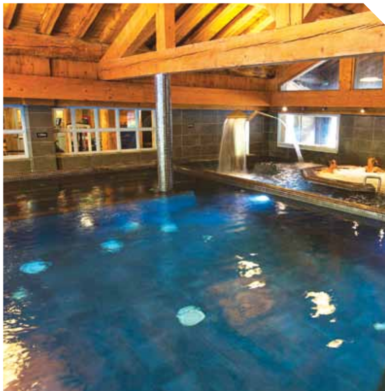
ABOVE: The spa at Chalet Hotel L'Ecrin

→ rooms, a swimming pool, sauna, Turkish bath and Jacuzzi. Even getting dressed is a pleasure, thanks to handy glove and boot warmers.