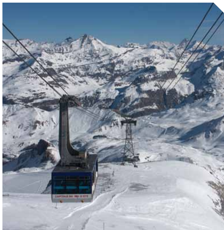
ABOVE: Ski lift, L'Espace Killy

Stansted, Luton and Bristol flights are not charters. Group offer T&Cs apply. Subject to availability. All offer prices are subject to availability, may be withdrawn or amended at any time and without prior notice. Mark Warner booking conditions apply.