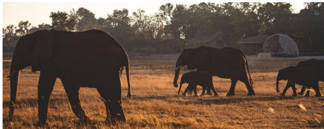
CLOCKWISE FROM LEFT: Elephants at Wilderness Safaris' Jao Camp, Botswana; quiver tree, Namibia; Phinda Private Game Reserve, KwaZulu-Natal; Zambia PREVIOUS PAGE: Wildebeest in Serengeti National Park, Tanzania