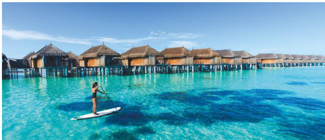
CLOCKWISE FROM LEFT: Constance Moofushi, the Maldives; Four Seasons Resort Seychelles at Desroches Island; a turtle at Biyadhoo, the Maldives; Coco Bodu Hithi, the Maldives