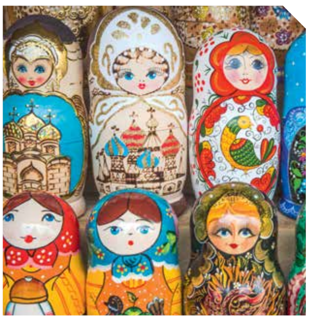
LEFT: Matryoshka dolls, Russia