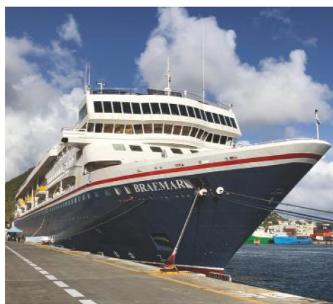
CLOCKWISE FROM ABOVE: Food stall in Marigot, Saint Martin; the St Kitts Scenic Railway; Fred Olsen Cruise Lines' Braemar