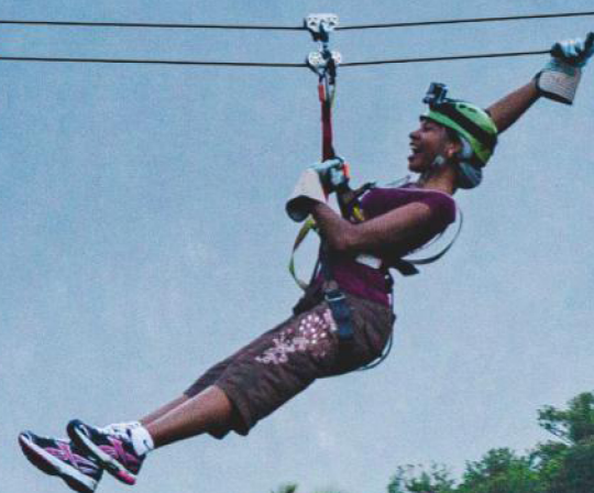
Zipline at Morne Coubaril Historical Adventure Park, Saint Lucia