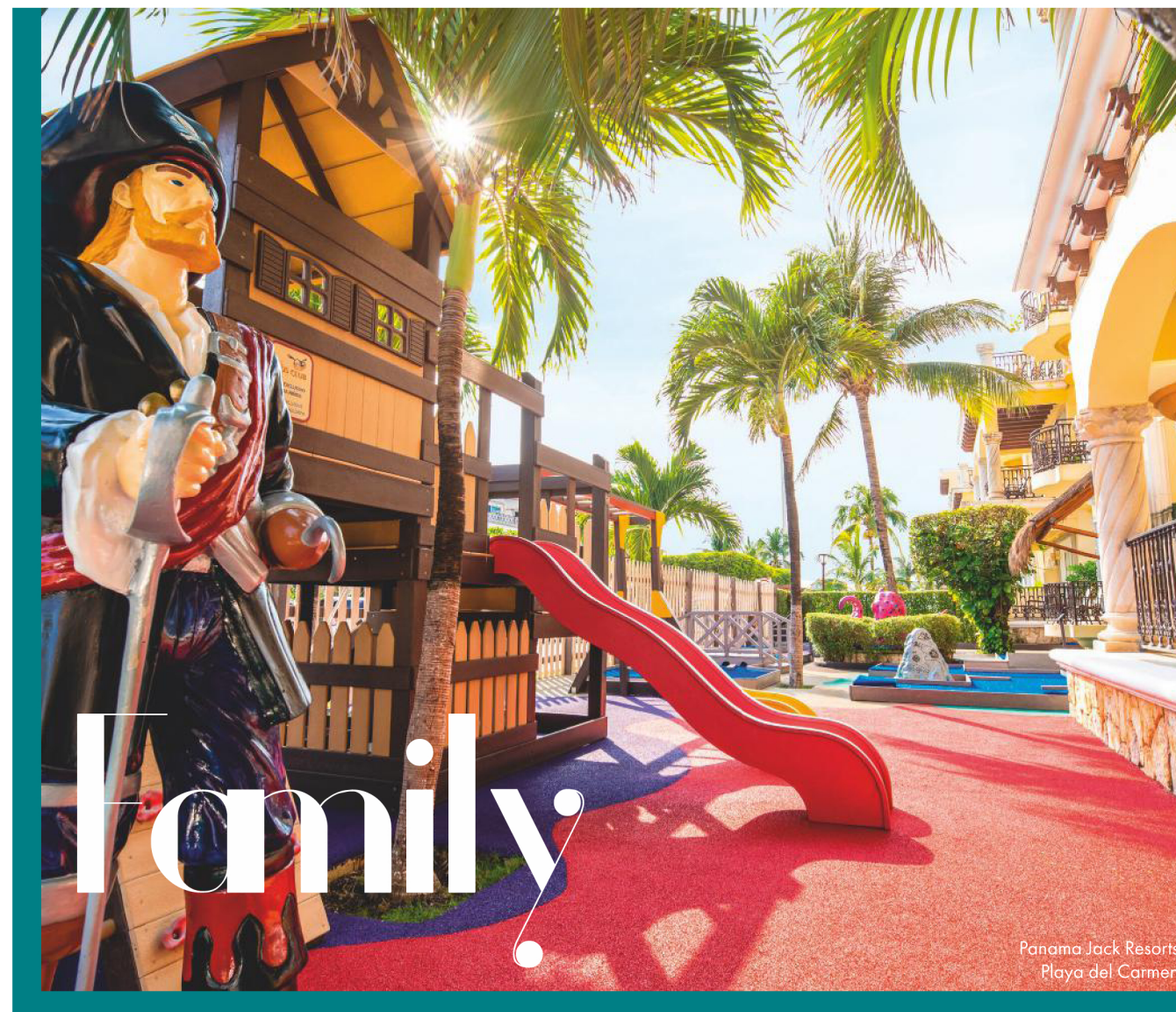
Panama Jack Resorts Playa del Carmen

On the sun-drenched shores of the Caribbean sits family-focused Panama Jack Resorts Playa del Carmen. The huge lobby is friendly and inviting, with plush sofas and armchairs in the bar, Jack's Landing. It's a welcome respite from the blazing sunshine outside, and the perfect place to indulge in a signature cocktail or recharge with a fresh coffee and pastry. The suites are large and airy, with muted decor that feels cool and calming. Standard rooms come with two double beds and a semi-private terrace, while junior suites boast a king-size bed, private balcony and