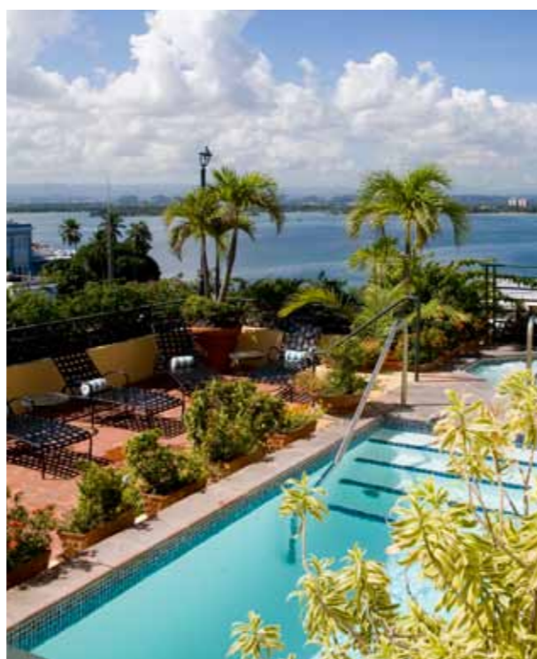
RIGHT: El Convento, Old San Juan

cycle, play ball games or walk their dogs on the grassy lawns. If you want to soak up the local vibe this is the place to hang out, and as an added bonus there's a great view of the fort and city wall from the white sand bay.