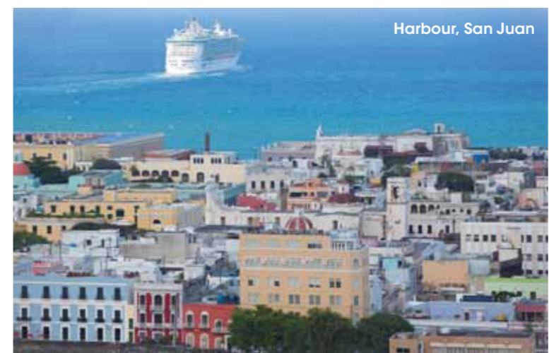
Harbour, San Juan