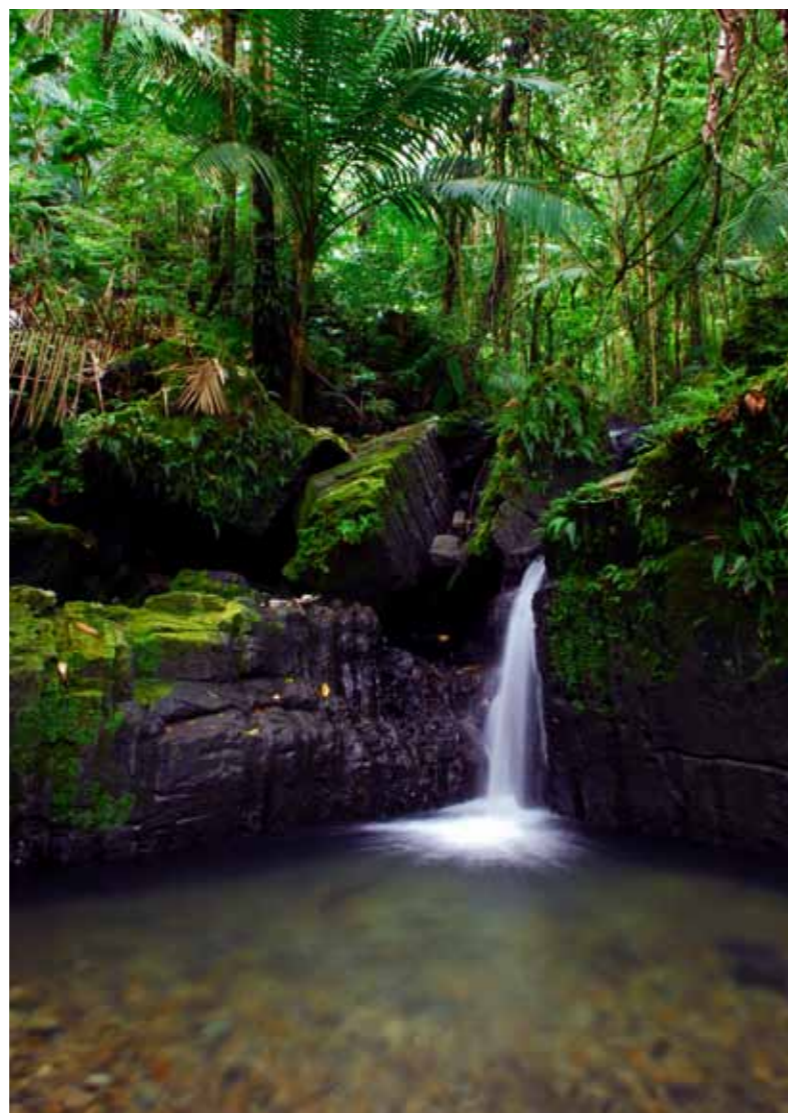
ABOVE: El Yunque waterfall

Close to San Juan old town, meanwhile, is the bustling and cosmopolitan Playa Escambron, where the town's folk come to snorkel, scuba dive, surf, jog,