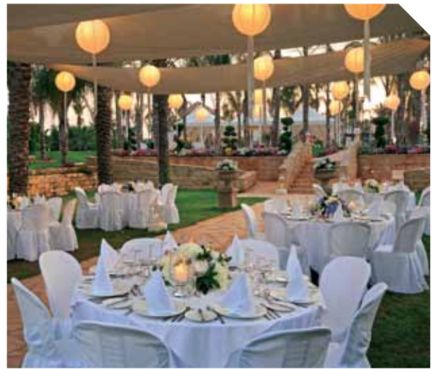
BELOW: Secrets Resorts & Spas

→ to be a much smaller wedding party because it's a bit more expensive.