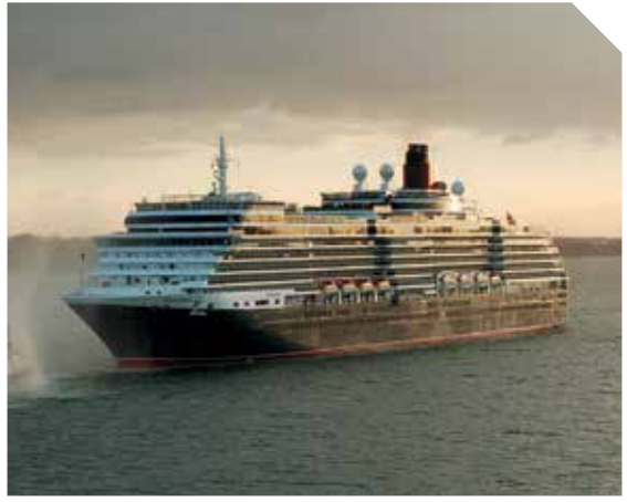
LEFT: Hebridean Princess in Tobermory BELOW: Cunard's Queen Victoria

sailings in favour of voyages around Scotland because so many of its passengers had done the former and wanted something different.