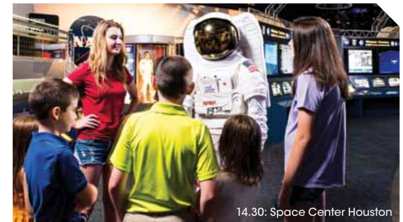
14.30: Space Center Houston

14.30: No visit to Houston is complete without a visit to outer space, so set aside a few hours to boldly go to Space Center Houston, a half-hour drive from Downtown. Ride a tram for a tour of the Space Center, getting close to Nasa's headquarters, visit the old and new Mission Control