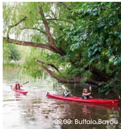
09.00: Buffalo Bayou

President Nixon and Michael Jackson are among the A-listers to have stayed at this boutique property in the Museum District. Each room is unique, while the huge concept suites include Houston We Have A Problem, complete with a moon-shaped sofa. Doubles from £170 per night. hotelzaza.com