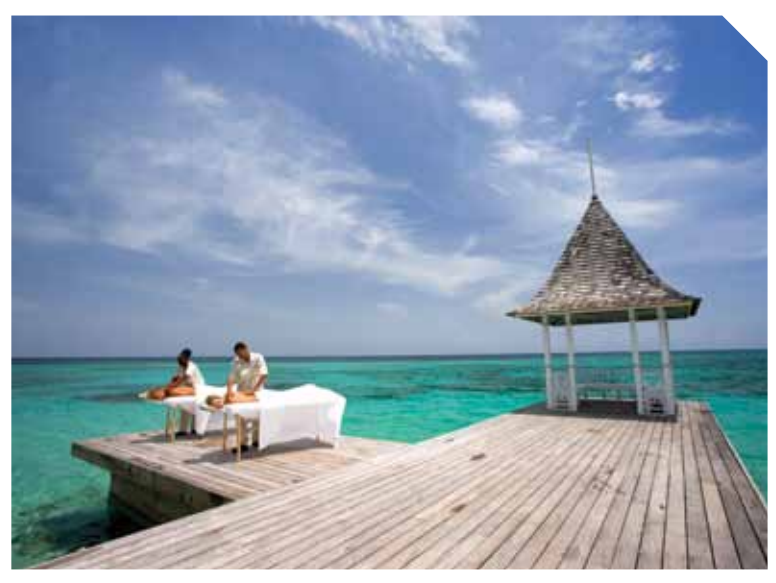
ABOVE: Sandals Royal Bahamiam Spa Resort

couples or those with teens (aged 14-plus) a more affordable spa experience. It's a no-frills set-up with a steam room and relaxation area and dipping pool. That said, the treatments - which