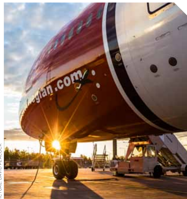
LEFT: Norwegian is expanding its UK links to the US