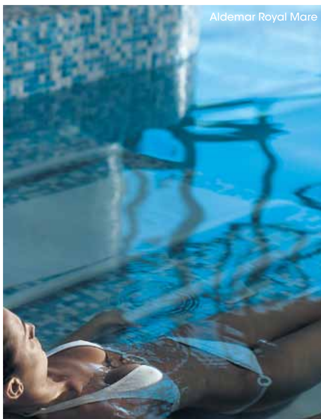
Aldemar Royal Mare

Over on Mykonos, Kensho Boutique Hotel & Suites has a spa known as the 'Cave' with rock-boulder walls, a colourful light-up pool and tropical rain bed, plus high-tech sun beds that let users customise the sound, heat and