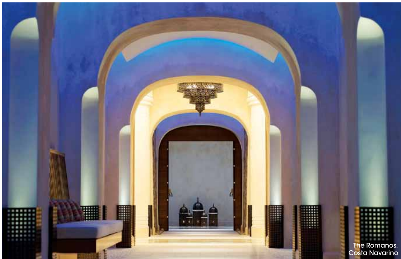
The Romanos, Costa Navarino

Olympic Holidays has a week's B&B at Casale Panayiotis, Cyprus, from £799 per person in mid-April, including flights and car hire. planet-holidays.co.uk