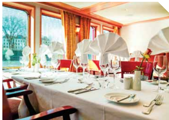
LEFT AND ABOVE: Serenade 1's sundeck and

Elsewhere there's a small fitness room and sauna for those wanting