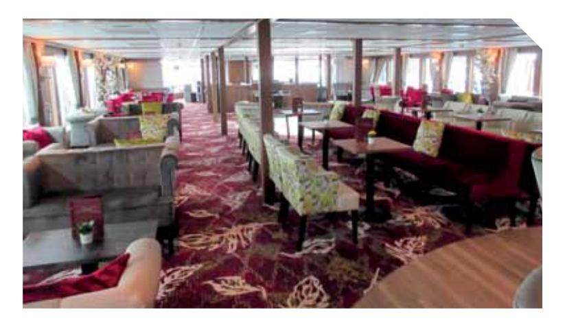
ABOVE: The River Cruise Line's Serenity

Next up were the Keukenhof Gardens, complete with vibrant tulip displays rolling into the distance and meticulously