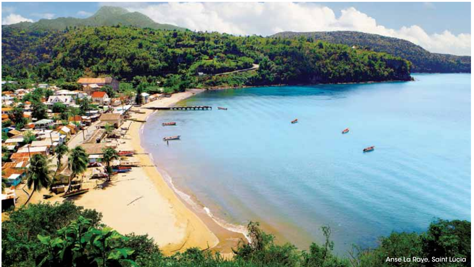
Anse La Raye, Saint Lucia