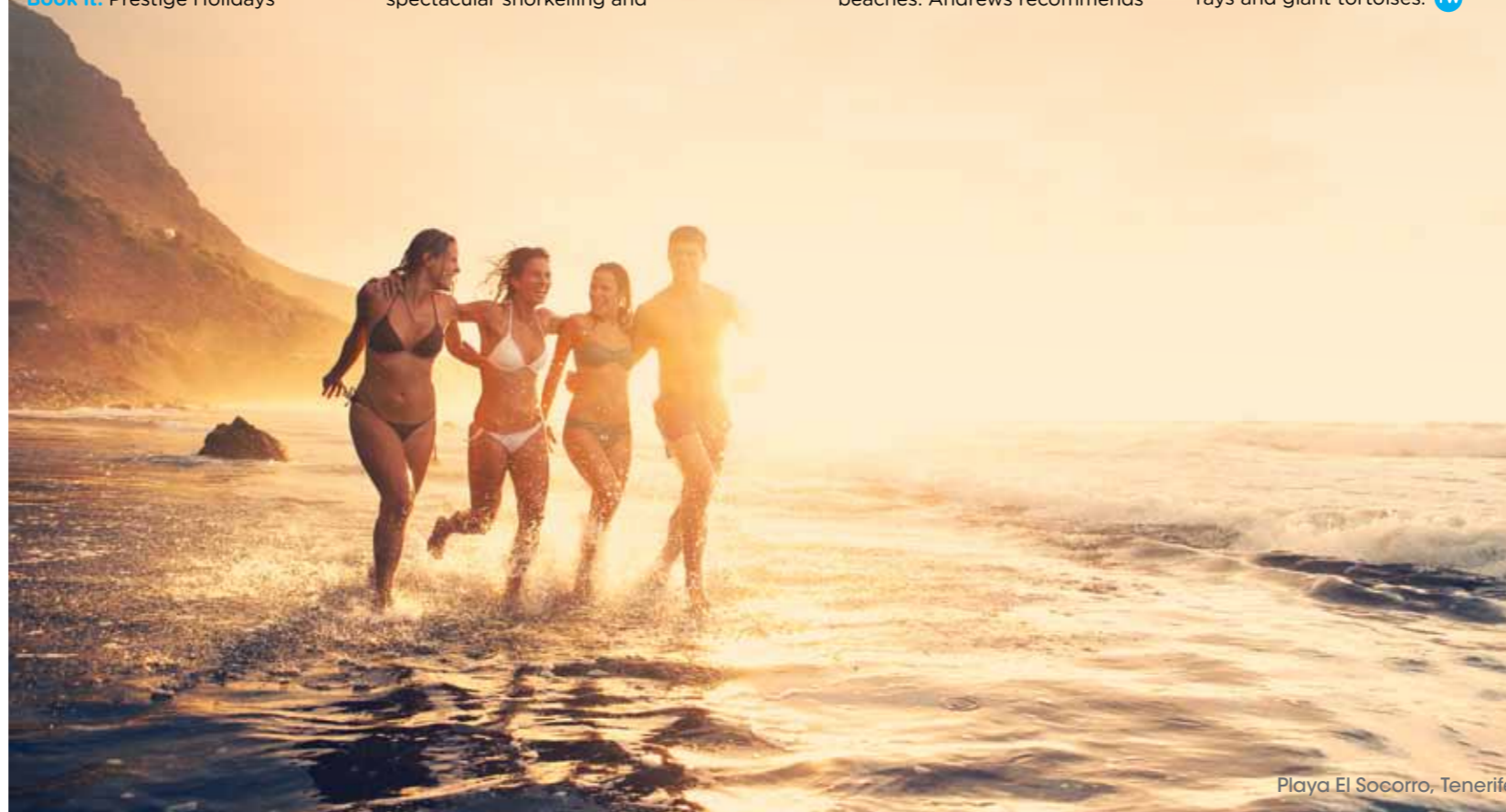
Playa El Socorro, Tenerife

clients snorkel and dive among impressive coral reefs and sea turtles at Smith's Reef and the Bight Reef. Away from the beach, other must-see attractions include a flamingo sanctuary on North Caicos; the world's only conch farm in Provo; and rock iguanas on Little Water Cay. Humpback whales can be spotted around Grand Turk and Salt Cay from late January to early April. Book it: Funway offers seven nights' room-only accommodation at the four-star The Sands at Grace Bay from £1,729, including flights departing December 4. funway4agents.co.uk Or try: For clients seeking a dream beach destination, suggest the paradise island of Zanzibar off the coast of East Africa, where winter temperatures sizzle around the high 20s. As well as boasting beaches with powder-white sand and turquoise waters, wildlife lovers can swim alongside dolphins, manta rays and giant tortoises. TW