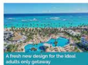
A fresh new design for the ideal adults only getaway

Experience a fresh new design at the fully renovated adults-only Luxury Bahia Principe Ambar with the addition of new swim-up suites, refurbished restaurants and coffee shop. Or turn up the music at the revamped adults-only Grand Bahia Principe Aquamarine , think white party, wine tasting, salsa and merengue lessons. Whichever you choose, you'll escape to a new kind of vacation.