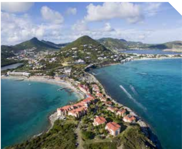
LEFT: Sint Maarten