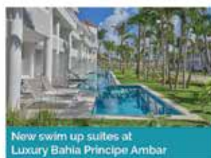
New swim up suites at Luxury Bahia Principe Ambar