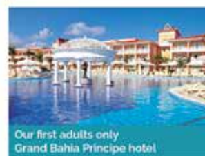
Our first adults only Grand Bahia Principe hotel