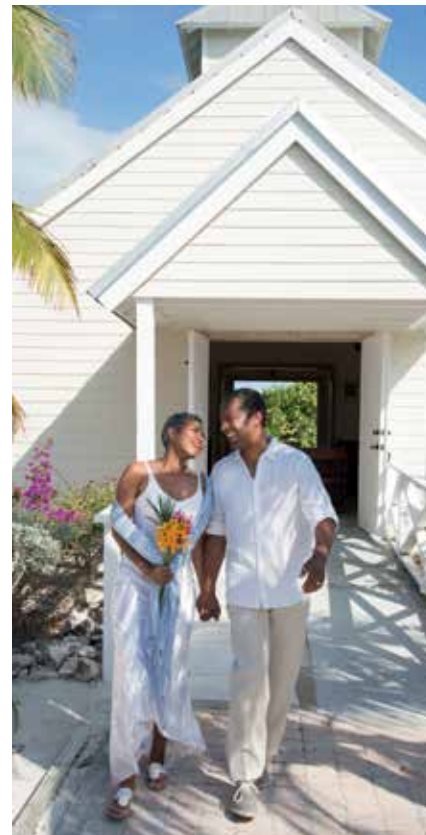
CLOCKWISE FROM TOP: Princess Cruises onboard wedding; chapel on Half Moon Cay, the Bahamas, with Holland America Line; beach wedding with Celebrity Cruises