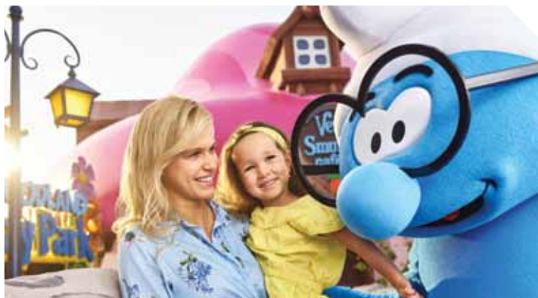
ABOVE: Smurfs Village, Motiongate Dubai

➔ Book it: Funway Holidays offers a week room-only in a Poolside Room at Universal's Cabana Bay from £740 per person, based on two adults and two under-10s travelling on October 20, with United Airlines flights from Heathrow. funway4agents.co.uk