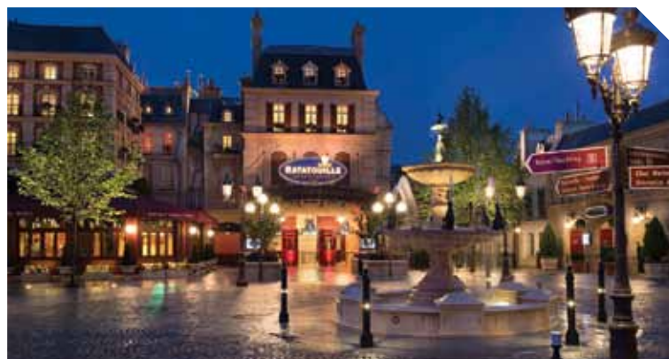
ABOVE: Ratatouille: The Adventure, Disneyland Paris

Among its most impressive creations is the Hulk Epsilon Base 3D, a cinema-style attraction where visitors are surrounded by a 360-degree domed screen, with immersive visuals bringing the story of this green giant's fight against his foe to life – one for the whole family to try. Book it: Do Something Different offers a one-day ticket to IMG Worlds of Adventure from £51 per person. dosomethingdifferent.com