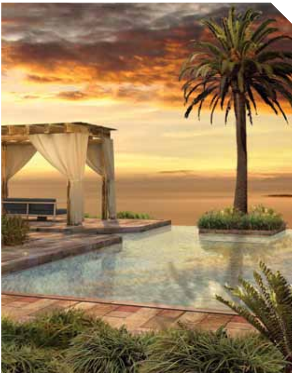
LEFT: Bumi Hills, Zimbabwe