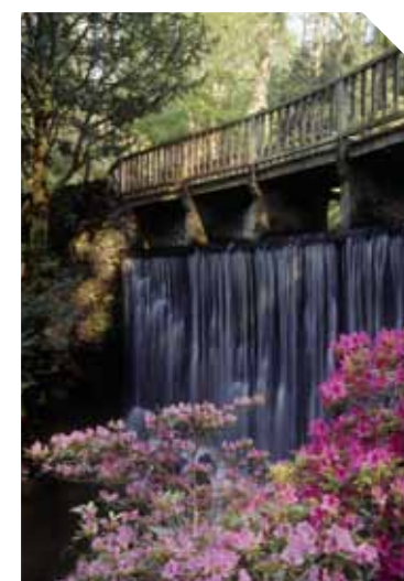
ABOVE: Bodnant Garden, Conwy

Smash hit series Game of Thrones might seem a racy fit for the genteel National Trust, but the historic farmyard at Castle Ward in County Down stood in for Winterfell, the home of the Stark family, and the site is home