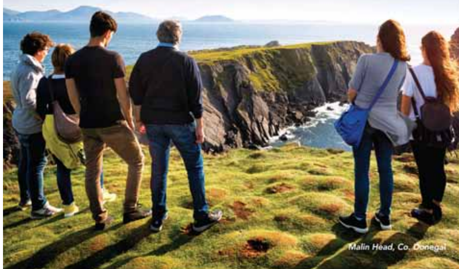
Malin Head, Co. Donegal

CIE Tours offers over 45 award-winning guided holidays to Ireland, Scotland, England and Wales, as well as Independent and Luxury Private Driver programs. With more options, you will find the perfect holiday for your clients. Our tours earn 94% customer satisfaction rating and you'll earn excellent commissions!