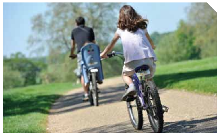
RIGHT: Ickworth House, Suffolk