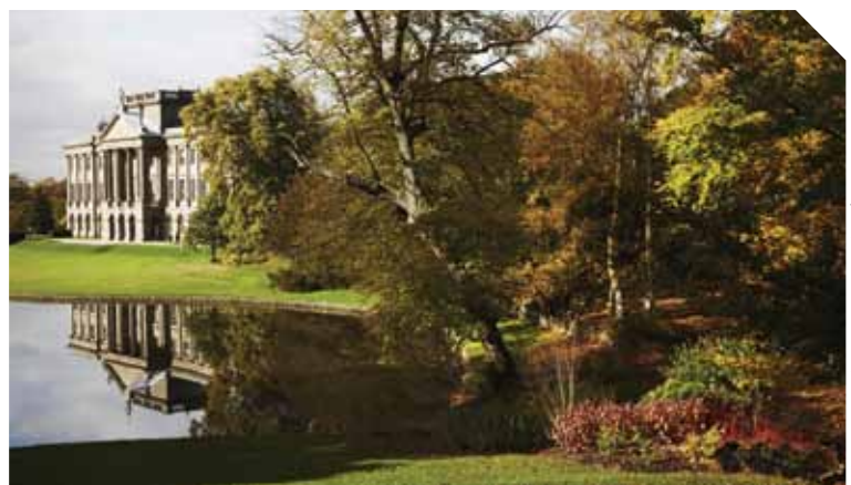
ABOVE: Lyme Park, Cheshire

Book it: Just Go! Holidays offers a range of tours in association