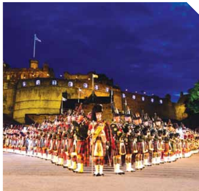
ABOVE: Edinburgh Tattoo

Great Rail Journeys has a host of iconic railway journeys and steam train trips, but also emphasises that not all its customers are die-hard rail obsessives. New itineraries include the 10-day All Inclusive Tuscan Villa trip, with a relaxing stay in a rural property and low-key sightseeing bookended by rail travel, from £2,495. Sister value brand Rail Discoveries offers a similarly chilled-out holiday on the French Riviera, the eight-day St Raphael & the Cote D'Azur, from £875.