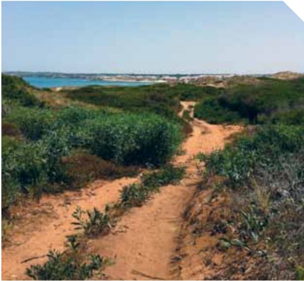
LEFT: Rota Vicentina trail, Alentejo