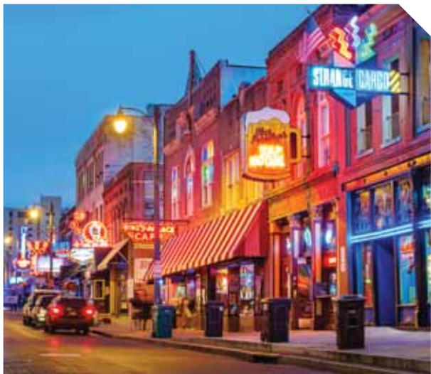
LEFT: Memphis, US