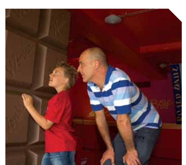
LEFT: Roald Dahl Museum and Story Centre

To go one step further, Austen lovers can stay in the writer's former home, which has been transformed into four luxury apartments, available to rent through Bath Boutique Stays. BOOK IT: Saga's A Celebration of Words and Music by Jane Austen tour departs in September 2017