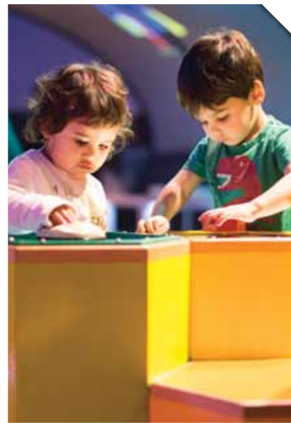
BOTTOM LEFT: Sea Life Aquarium