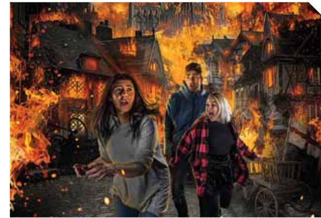
ABOVE: Escape the Great Fire of London at the London Dungeon

Piccadilly Circus, and end the day at the theatre. The Lion King and Matilda remain firm family favourites, and Disney's much-anticipated Aladdin opens next month.