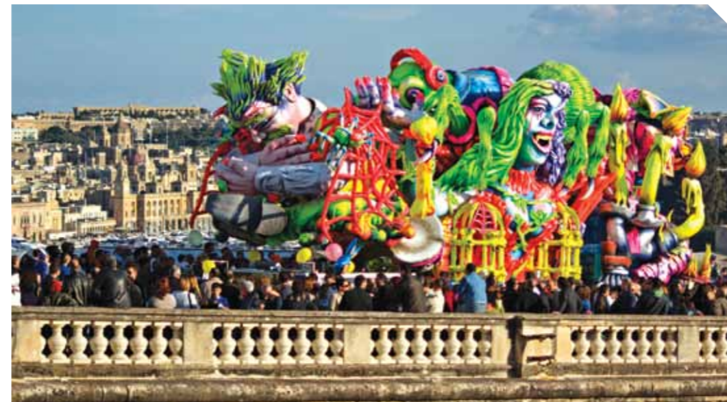
RIGHT: Carnival in February

“The Maltese love to party and the island plays host to various events, especially during carnival week