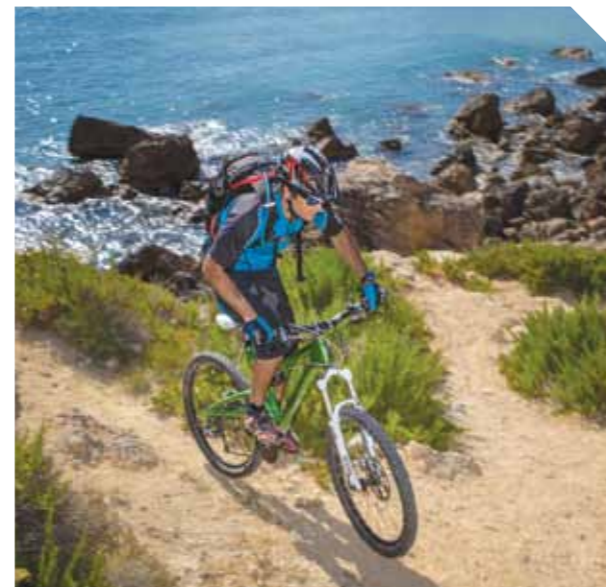
LEFT: Cycling in Malta