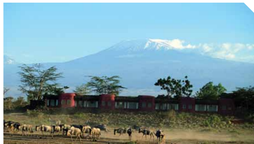
BELOW: Amboseli Serena Safari Lodge

Travel Uni agent training programme Jambo Kenya is relaunching in July. jambokenya.co.uk