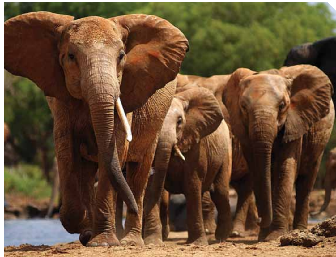
FAR RIGHT: Laikipia