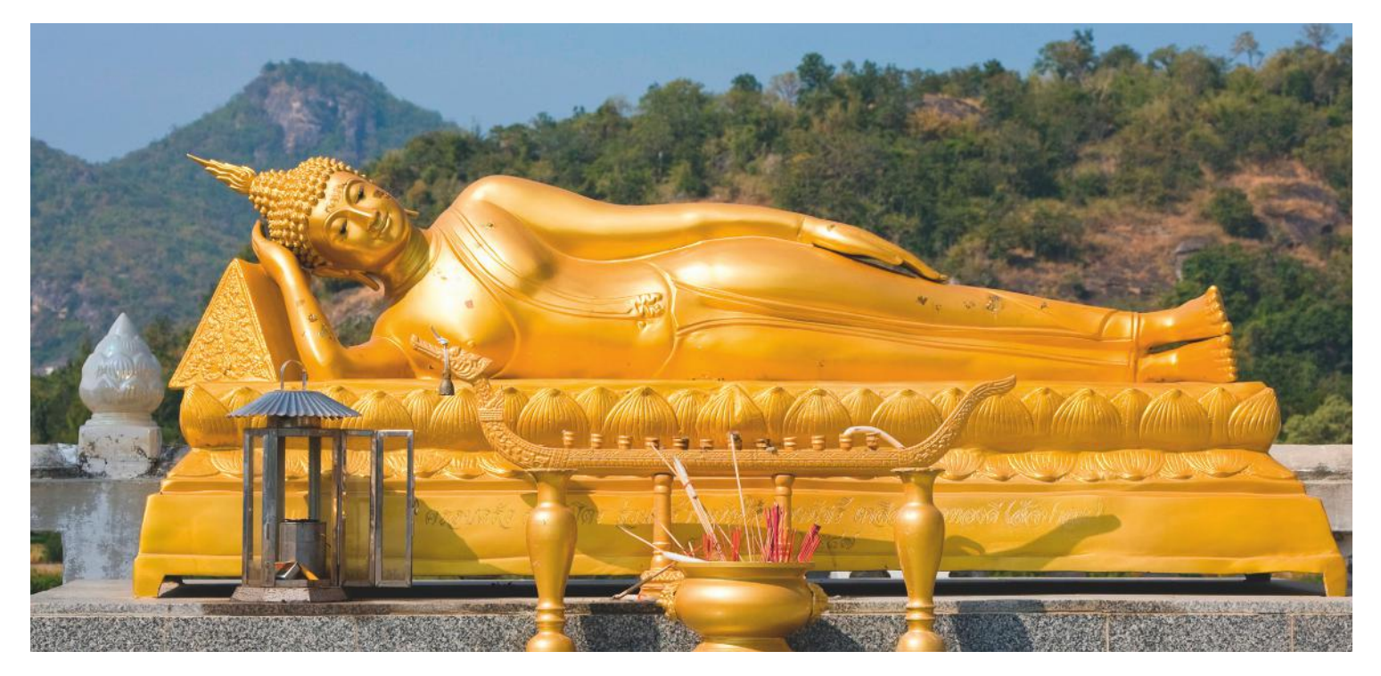
ABOVE: Reclining Buddha in Hua Hin, Thailand

feels like a cross between a glasshouse and an aircraft hangar, is a tribute to Prince Purachatra Jayakara, who established Thailand's first radio station in the 1930s. Inside, diners sit at tables surrounded by lush foliage and various knick-knacks, ranging from the replica biplane hanging from the ceiling to ancient radios, typewriters and Singer sewing machines.