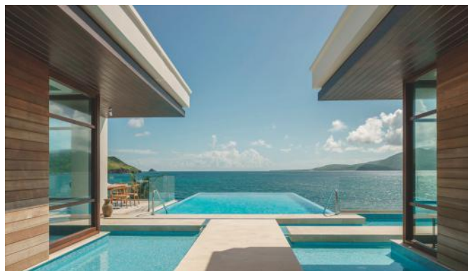
FROM LEFT: Presidential Suite at Park Hyatt St Kitts; St Kitts Music Festival; the island's lush interior

Beach: For a lively beach scene, Frigate Bay is popular with locals and visitors alike, with calm Caribbean waters on one side and Atlantic waves for surfers on the other. Expect beach bars and volleyball by day, then DJ beats and bonfires by night.