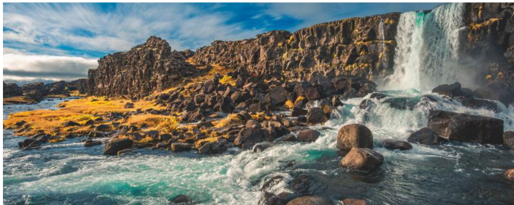
CLOCKWISE FROM LEFT: Thingvellir National Park, Iceland; Rondane National Park, Norway; Kitkajoki River, Oulanka National Park, Finland; northern lights, Abisko National Park, Sweden