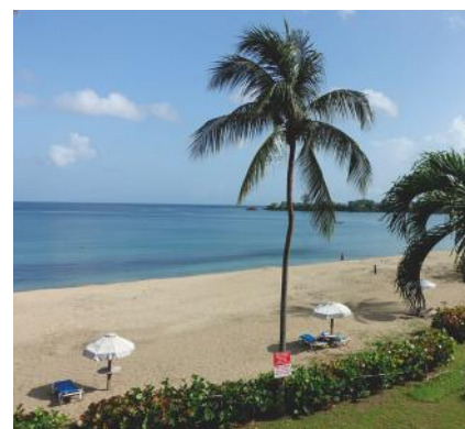
CLOCKWISE FROM TOP LEFT: Birdsong Lodge, Castara Retreats; white-tailed sabrewing; Starfish Tobago; Adventure Eco Villas; the pool at Starfish Tobago

PICTURES: Visit Tobago/Alex Treadway, Faraaz Abdool; Clare Vooght; Tobago Tourism Agency/Alexa Fernando