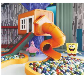
CLOCKWISE FROM ABOVE: Paw Patrol room, Land of Legends, Nickelodeon Hotels & Resorts, Turkey; Efteling Grand Hotel, Netherlands; Minion Land at Universal Studios Singapore; play area at Land of Legends

open in Hong Kong Disneyland and Tokyo Disney Resort, will transport guests to the Nordic wonderland of Arendelle, complete with Elsa's Ice Palace, Arendelle Village and Scandi-style shops and food outlets.