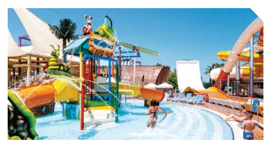
ABOVE: Pegasos World, Side