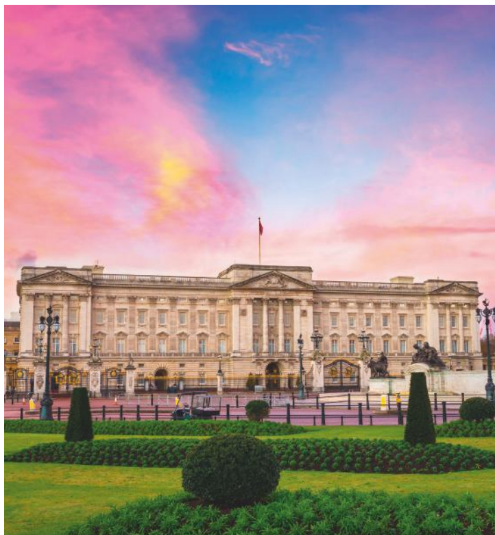
ABOVE: Buckingham Palace, London