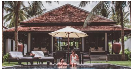
CLOCKWISE FROM TOP LEFT: Hoi An; Ho Chi Minh City; Four Seasons Resort The Nam Hai; Festa Phu Quoc, Curio Collection by Hilton