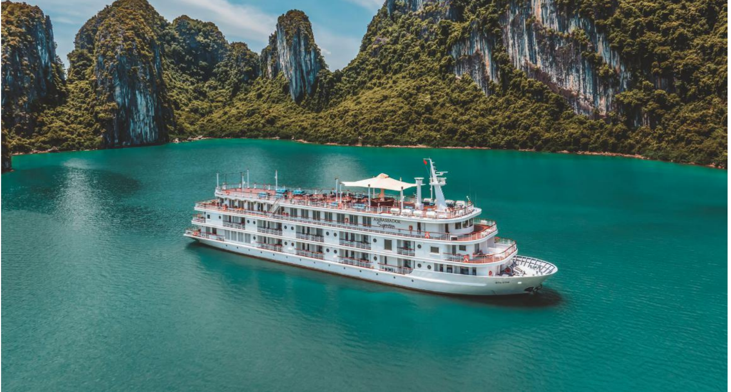
ABOVE: Vietnamese cruise line Ambassador Cruise has launched an itinerary that explores the limestone karsts of Lan Ha Bay

experiences such as lantern making on offer. New this year are a yogi wellness practitioner and Japanese-influenced restaurant and bar, which is set to open this month.