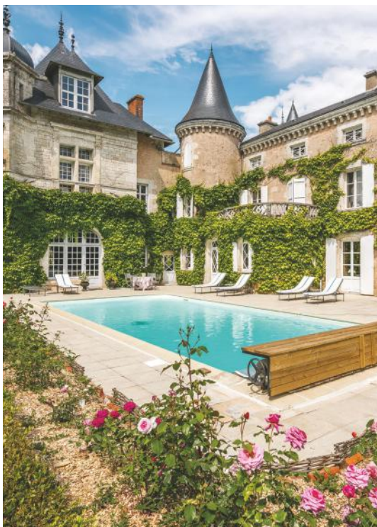
ABOVE: Oliver's Travels sells stays for up to 24 guests at The Secret Hamlet in the Loire Valley

Donna Such, senior villa sales expert at Villa Select, says: "Single villas that accommodate larger parties always book quickly, but we have neighbouring villas that can accommodate 30 guests or more."