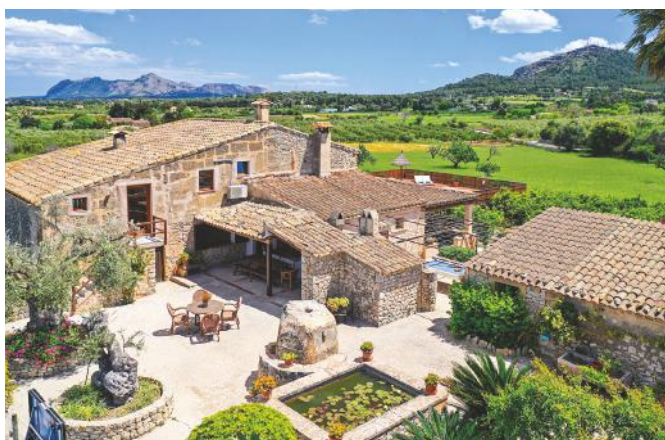
CLOCKWISE FROM LEFT: Kalamaki Bay House, Corfu; Villa Zaffre, Kalkan; Villa Sou, Alcudia