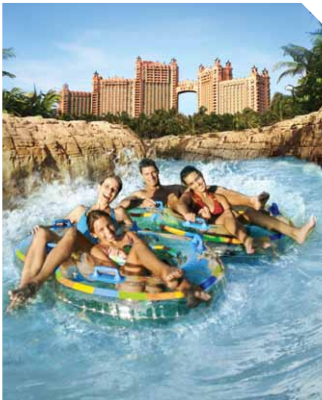
ABOVE: Wild Wadi Waterpark

A Walt Disney World Orlando 14-day Ultimate Ticket – currently the same price as a seven-day ticket – costs £299 for adults and £279 for three to nine-year-olds, offering access to all six Disney parks. disneytravelagents.co.uk