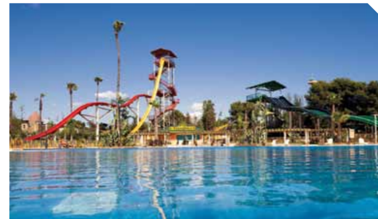
BELOW: Sunwing Waterworld Makadi

Adeje, where a week's all-inclusive starts at £389, including a shuttle bus to the park and free entry.